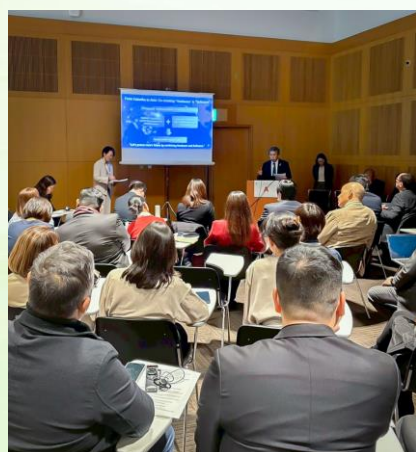
Scenes from FOF's presentation

FOF signed a Memorandum of Understanding with the UN-Habitat Fukuoka Office in August last year to advance collaborative initiatives. As part of this ongoing collaboration, FOF gave a presentation during the seminar's Co-Creation Network Session.